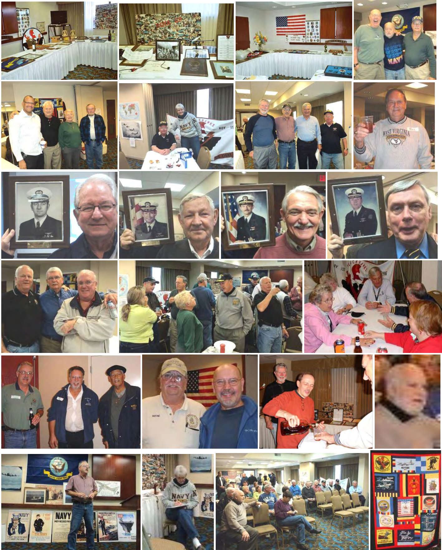
40 Year Reunion