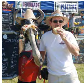
COW & ROZY SANDWICH