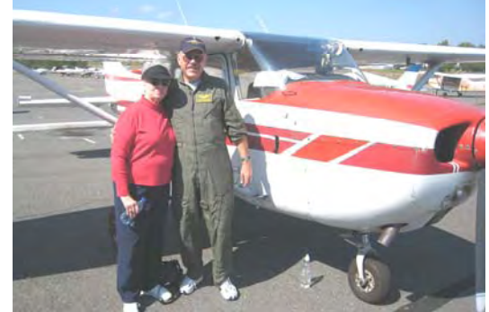
DEPLOYMENT FLIGHT CREW