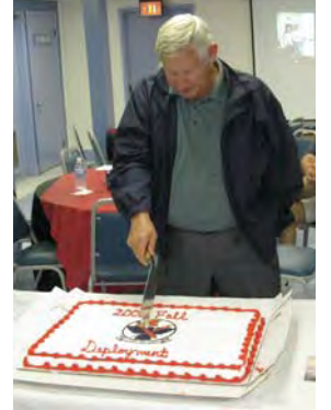
CO CUTTIN' CAKE