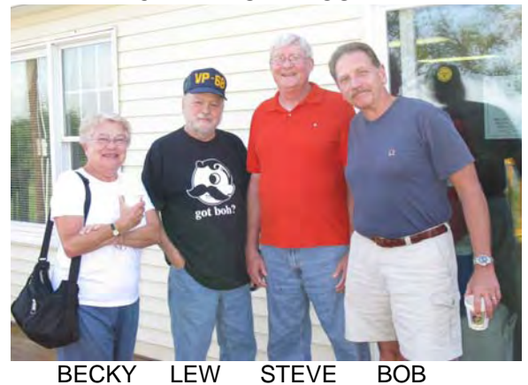
FUN - LAUGHS - FRIENDS