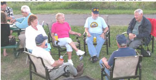
CREW 4 "SKY PIGS"