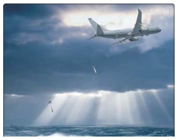
The Navy plans to purchase 108 P-8As with the first aircraft delivered to Pax River for flight test in 2009. The first squadron is planned to be operational (IOC) with the P-8A by 2013. Budgets and world events change things but that is the current plan to date.

Armament: torpedoes, cruise missiles, bombs, mines